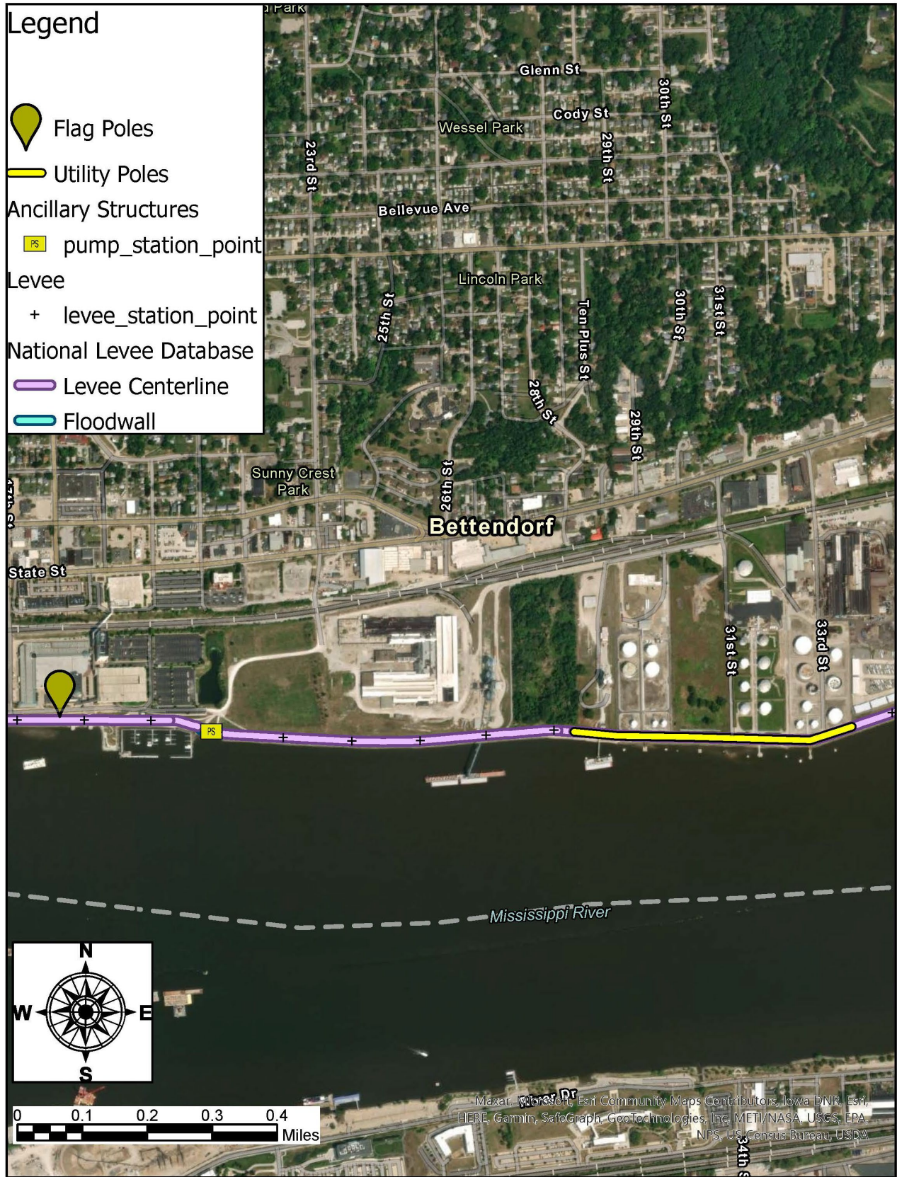
Figure 3. Project Site Map Showing Flagpoles and Utility Poles Encroachments